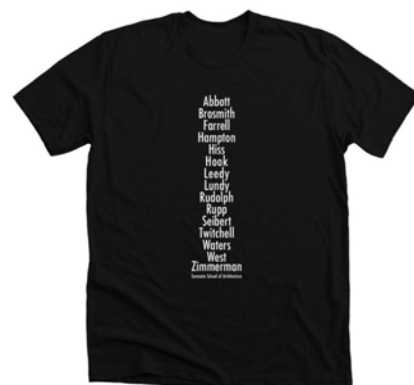
Sarasota to a T