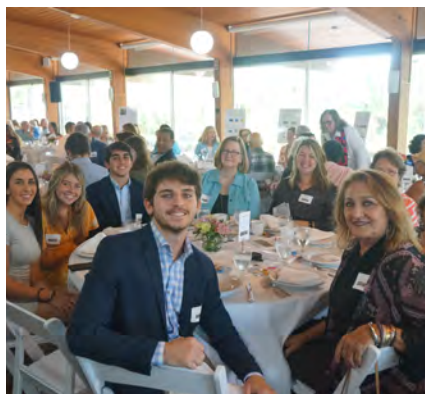
2022 Heritage Awards & the Launch of the Hall Preservation Campaign